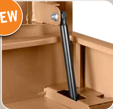
ANTI-SLAM LID Gas strut supported lid to control closing speed