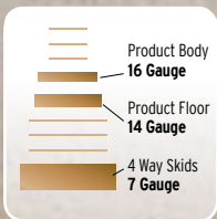
STEEL GAUGE CONSTRUCTION