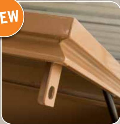
3 SIDED EASY GRIP LID Continuous ergonomic grip for easy access